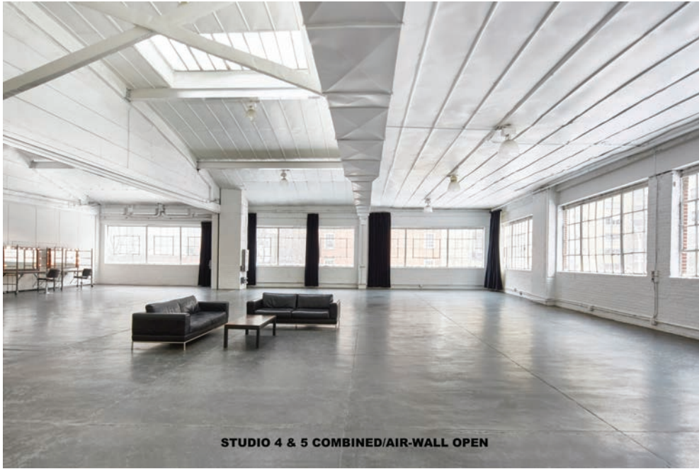
STUDIO 4 & 5 COMBINED/AIR-WALL OPEN