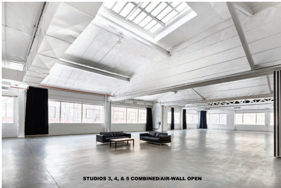
STUDIOS 3, 4, & 5 COMBINED/AIR-WALL OPEN