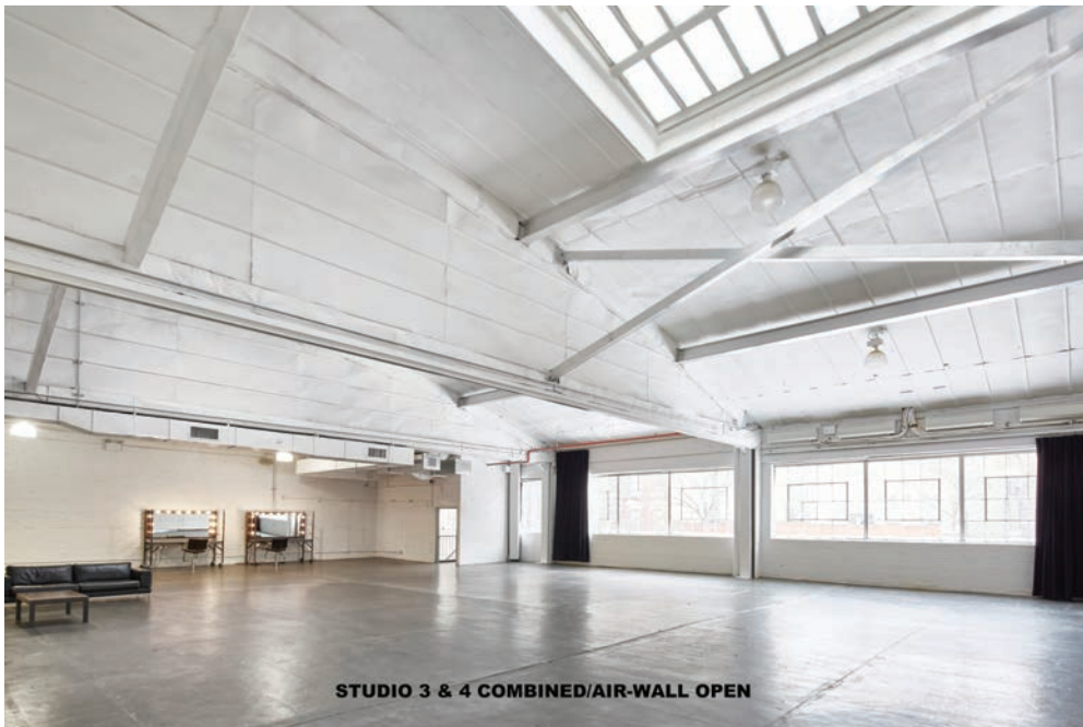
STUDIO 3 & 4 COMBINED/AIR-WALL OPEN