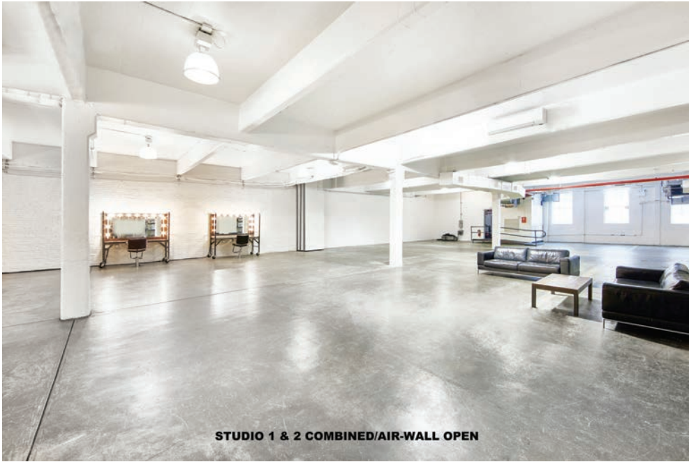
STUDIO 1 & 2 COMBINED/AIR-WALL OPEN