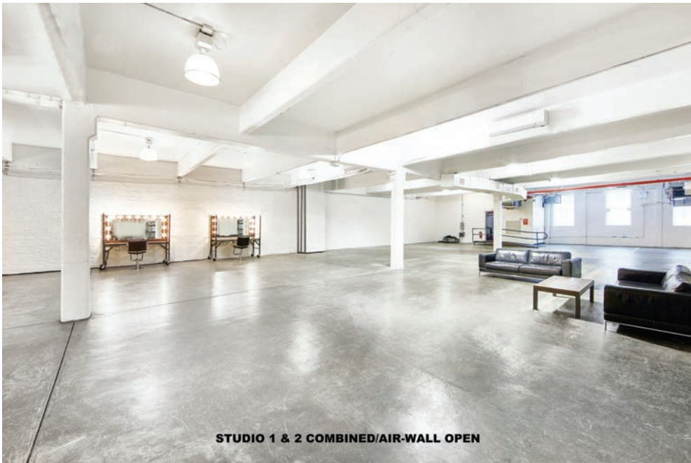
STUDIO 1 & 2 COMBINED/AIR-WALL OPEN